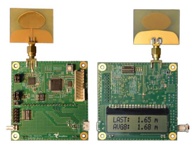
EVB1000 component side & display side views